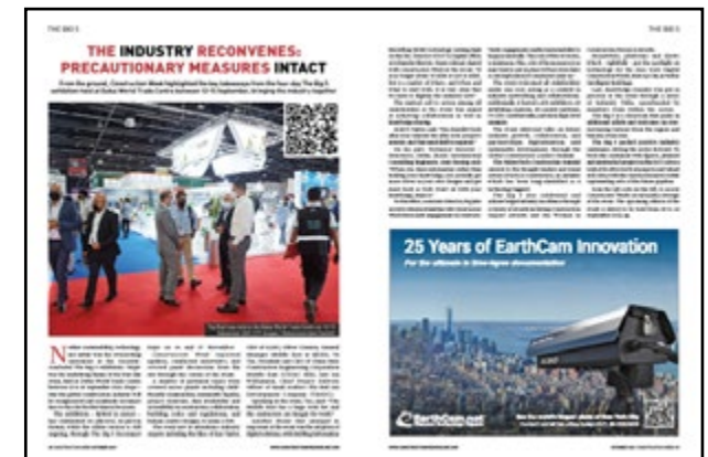
Industry event coverage